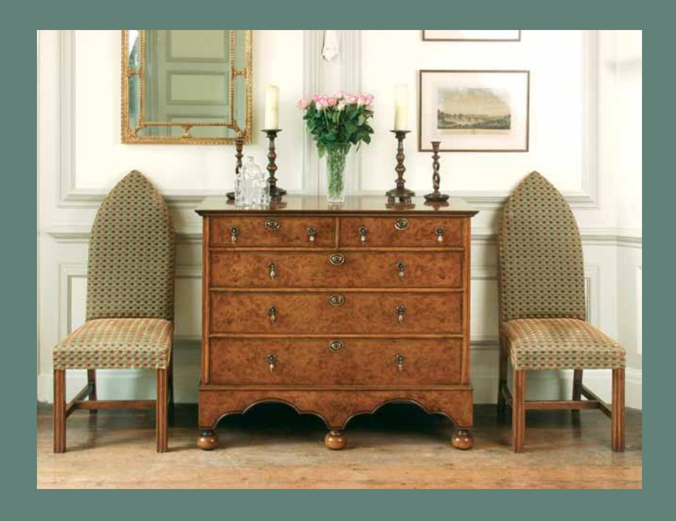
English Home Collection from Leeny Furniture